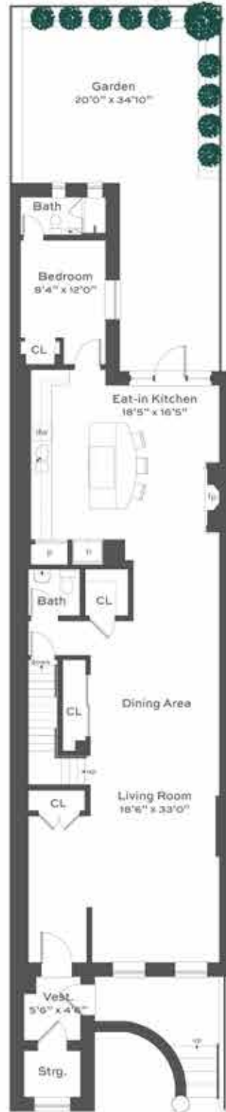
Garden Level Ceiling Height 9'4"