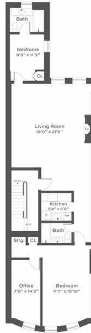
Second Floor Ceiling Height 10'3"