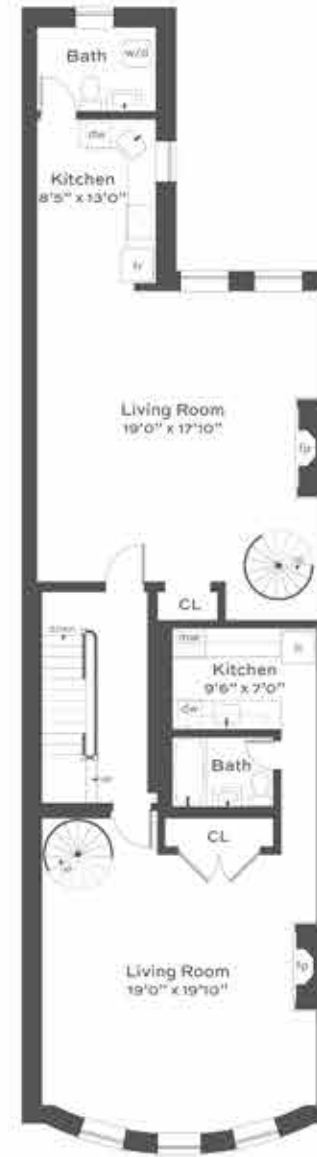
Third Floor Ceiling Height 10'2"