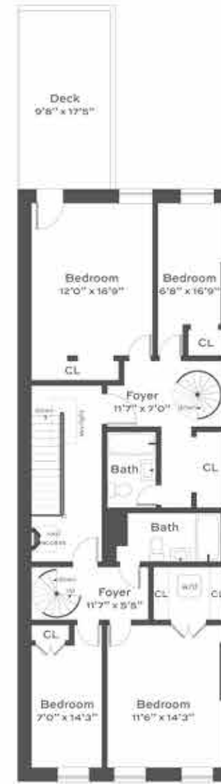
Fourth Floor Ceiling Height 9'6"