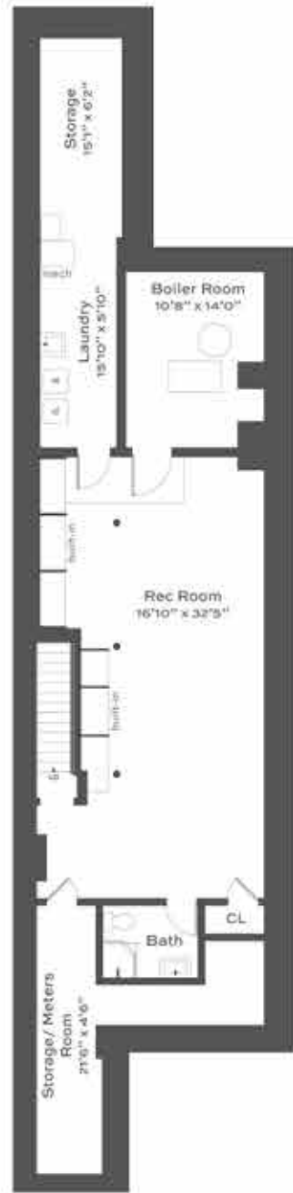
Cellar Ceiling Height 7'8"